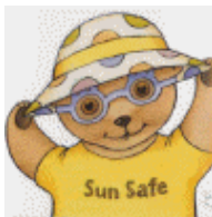
Sunshine Sam Teddy 06.07.006

Breast Self-Examination Trainer - made from a synthetic tissue which feels just like a real breast, the model has five lumps simulating easy and hard-to-find breast tumours. (The trainer includes an optional use slip-on cover and carrying case).