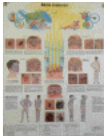
Skin Cancer 06.16.003

This laminated poster explains about cancer, the risk factors, the warning signs, the diagnosis and treatment of cancer. Can be used as a teaching aid and/or a source of reference. Measures 20" x 26".