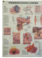
Understanding Cancer 06.16.001

This laminated poster gives a general overview of cancer cell division and how this may be diagnosed through biopsies, x-rays, scintiscans and catscans. Explains about cancer treatments such as surgery, radiation therapy and chemotherapy and can be used as a teaching aid and/or a source of reference. Measures 20"x 26".