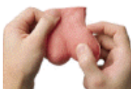
Testicular Self-examination Trainer 06.07.008

Designed to be used with 4-7 year olds introducing (or re-inforcing) the sun-safety messages:-* Always apply a sunscreen (at least SPF 15) before going out into the sun.* Cover up with closely-woven, loose clothing, an appropriate hat and sun glasses if desired. * Stay in the shade when the sun's rays are at their strongest (usually between 11.00am and 3.00pm). This pack comprises of a large 34" cardboard teddy bear who wears only a pair of shorts when undressed. T-shirt, hat, sunglasses, sunscreen & umbrella so children can dress the bear themselves. There are 6 x posters which show the teddy adopting sun-safe practices; 3 x photocopiable worksheets, a parents' leaflet & comprehensive user notes which give factual information on sun-safety and additional follow-up activity ideas. Ideal for work in nurseries, schools, play schemes and family centres.