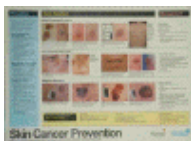
Skin Cancer Prevention 06.16.004

This laminated poster explains about many different aspects of skin cancer, can be used as a teaching aid and/or a source of reference. Measures 20"x 26".