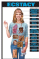
Ecstasy 30.16.009 The Algra Corp

From the Health & Drug Education Series, this chart shows the harmful effects of one of the most talked about subjects in schools today. The chart highlights the harmfully affected areas from cocaine use in bold colours. Size: 24" x 36"