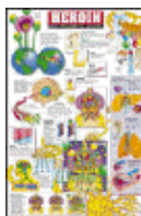
Heroin And It's Harmful Effects 30.16.004

From the Health & Drug Education Series, this chart shows the harmful effects of heroin. Size: 24" x 36"