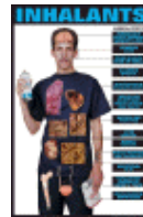
Inhalants 30.16.012 The Algra Corp

a source of reference. Approximate size 60 x 90cm