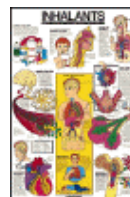
Inhalants And Their Harmful Effects 30.16.005

From the Health & Drug Education Series, this chart shows the harmful effects of inhalants. Size: 24" x 36"