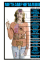
Methamphetamine 30.16.011 The Algra Corp

This laminated poster highlights the dangers of inhalants and their harmful effects. For use as a teaching aid and/or a source of reference. Approximate size 60 x 90cm.