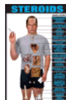
Steroids 30.16.008 The Algra Corp

From the Health & Drug Education Series, this chart shows the harmful effects of methamphetamine. Size: 24" x 36"