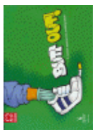
Butt Out! 28.11.011

British Heart Foundation and QUIT have brought their expertise together in the fields of heart disease and smoking issues, to develop this project. BUTT-OUT! is a cross-curricular pack about smoking which is designed for teachers of 11-16 year olds. The original idea for this pack was set up as a competition. Young people developed their creative competition entries as their understanding of the issues broadened in response to the class project. The ideas and materials in this pack can be used for single class, year group or whole school projects or presentations, or organised as a competition.