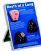
Death Of A Lung 28.07.008

This display features 3D models that show the diseases and conditions that can result from smoking; cancer, heart disease, ulcers, emphysema, and more. Presented in a wooden carrying case which can be set up in seconds, measures 28" x 27" when opened.