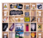
What's In Tobacco Smoke? 28.07.019

This boxed display and fact sheets present a full set of the new government health warnings found on all cigarette packs. An excellent tool for promoting discussion about the dangers of smoking by focussing on these stark warnings. Ready to hang or display and protected by an acrylic cover. Supplied with a acrylic A5 leaflet holder with factsheets giving supporting information about each warning.