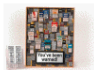
You've Been Warned 28.07.016

This boxed display looking like a lifestyle retro display shows the effects of smoking with a humorous but hard-hitting twist. It focuses on the 'must have' accessories that all smokers shouldn't be seen without, this season - or any other. These include wrinkle cream, Viagra, a 330 day calendar, breath mints, dentures, a tracheal tube, nasal cannula, stacks of money, a clothes repair kit etc. A sideways look at smoking and its effects. The frame is ready to hang and can be used in an educational setting or for stop smoking campaigns and publicity events.