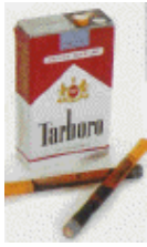
A Pack Of Toxic Tar 28.07.003

Many people give little thought to the amount of dangerous tar found in cigarettes. This realistic display contains two removable cigarettes filled with gooey tar. The tar in these two cigarettes represents the amount of toxic tar that a smoker receives from smoking one pack of cigarettes. Display is 2 1/8" x 7/8" x 3 5/8".