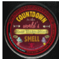
Disgusting Smell: Tobacco 28.07.033

This display shows a realistic model of lung tissue affected by smoking. Cast from real specimens, these three hand painted models represent a normal lung, a lung with emphysema, and a lung with cancer. This unique display illustrates the dangers of smoking. Measures 9" x 12".