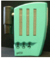
Co Monitor: Bedfont Micro Smokerlyzer 28.07.005

This CO Monitor is designed to give an immediate indication of the amount of carbon monoxide present in an individual's bloodstream. An excellent resource for use in smoking cessation classes and any discussions about the effects of passive smoking. Cardboard tubes are required when using this CO monitor and can be purchased on a Sale/Return basis @ 10p each.