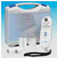
Co Monitor: Micro Medical Smoke Check 28.07.020

This CO Monitor is designed to give an immediate indication of the amount of carbon monoxide present in an individual's bloodstream. An excellent resource for use in smoking cessation classes and any discussions about the effects of passive smoking. Cardboard tubes are required when using this CO monitor and can be purchased on a Sale/Return basis @ 10p each.