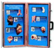
Consequences Of Smoking 28.07.010

This CO Monitor is a hand held battery operated device used to measure the concentration of carbon monoxide, CO, on the breath. It is used for instructional purposes in smoking cessation programmes and to check on the clients' progress and compliance. It is accurate, easy to use, and has many features designed to simplify its operation. These include: ~ Auto zero function~ Smoking level colour light indicators~ High CO alarm~ Simple calibration