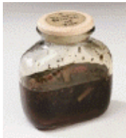
A Year's Worth Of Tar 28.07.021

Many people give little thought to the amount of dangerous tar found in cigarettes. This realistic display contains two removable cigarettes filled with gooey tar. The tar in these two cigarettes represents the amount of toxic tar that a smoker receives from smoking one pack of cigarettes. Display is 2 1/8" x 7/8" x 3 5/8".