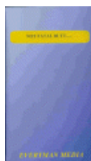
Not Fatal Butt... 28.11.005

Fast moving and funny with hard hitting visuals and wacky characters, the surreal delivery of this programme stands out from anything you've seen on the subject of tobacco and smoking. Featuring Wheezer Geezer, Top Tips and White Room, the moving pictures provide an alternative delivery to the usual assortment of masses of facts and figures.