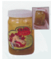
Clem's Phlegm Model 28.07.023

This apparatus offers an efficient way to demonstrate the amount of tar that is inhaled into the lungs with each cigarette. The amount of tar produced by different cigarettes can be investigated, as can the effects of filters, only smoking part of the cigarette, etc.