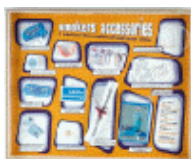
Smokers' Accessories 28.07.027

This boxed display looking like a lifestyle retro display shows the effects of smoking with a humorous but hard-hitting twist. It focuses on the 'must have' accessories that all smokers shouldn't be seen without, this season - or any other. These include wrinkle cream, Viagra, a 330 day calendar, breath mints, dentures, a tracheal tube, nasal cannula, stacks of money, a clothes repair kit etc. A sideways look at smoking and its effects. The frame is ready to hang and can be used in an educational setting or for stop smoking campaigns and publicity events.