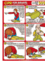
Cpr For Infants (younger Than 1 Year) 16.16.008

This laminated poster explains about; first degree, second degree and third degree burns. Suitable for use as a teaching aid and/or a source of reference. Measures 20" x 26".