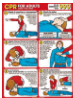
Cpr For Adults (ages 9 And Over) 16.16.006

This laminated poster shows how to perform CPR (Cardiopulmonary Resuscitation) on infants (younger than 1 year). Suitable for use as a teaching aid and/or a source of reference. Approximate size 46 x 60cm.