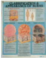
Classification & Appearance Of Burns 16.16.003

This laminated poster explains about; first degree, second degree and third degree burns. Suitable for use as a teaching aid and/or a source of reference. Measures 20" x 26".