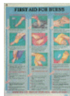
First Aid For Burns 16.16.001

This laminated poster shows how to perform CPR (Cardiopulmonary Resuscitation) on adults. Suitable as a teaching aid/or a source of reference. Approximate size 46 x 60cm.