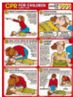
Cpr For Children (ages 1 To 8) 16.16.007

This laminated poster explains how to deal with burns, explains about the do's and don'ts of treating burns from 1st degree burns to 3rd degree burns. Can be used as a teaching aid and/or a source of reference. Measures 20" x 26".