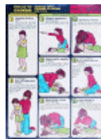
First-aid For Choking (ages 1 To 8) 16.16.005

This laminated poster shows how to perform CPR (Cardiopulmonary Resuscitation) on children. Suitable as a teaching aid and/or a source of reference. Approximate size 46 x 60cm